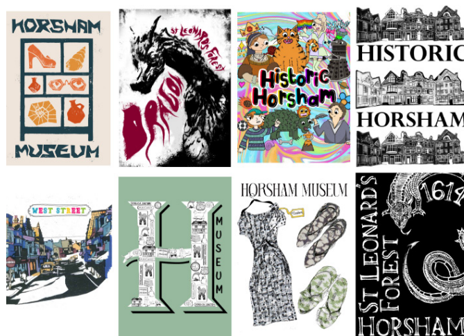
Collyers pop-up shop artwork