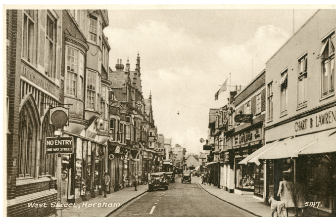
Postcard of West Street in 1948