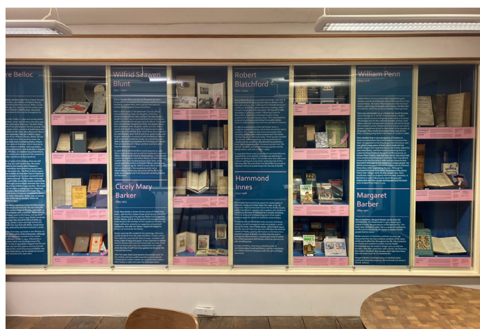
Research room display