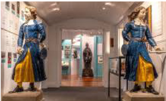
Christ's Hospital Museum