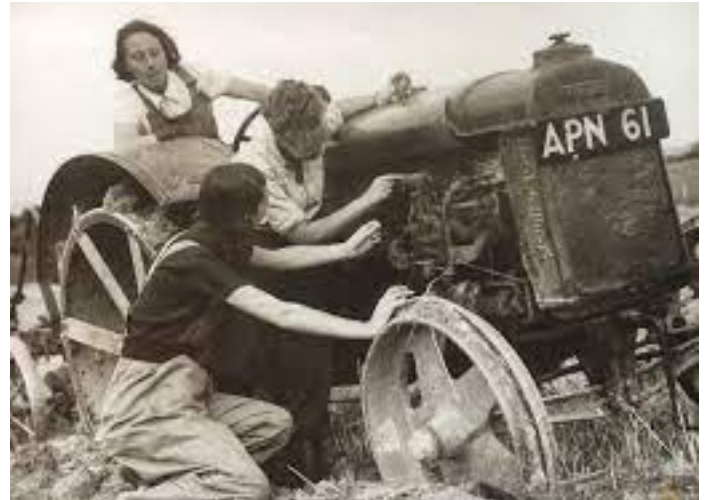
Land Army Girls