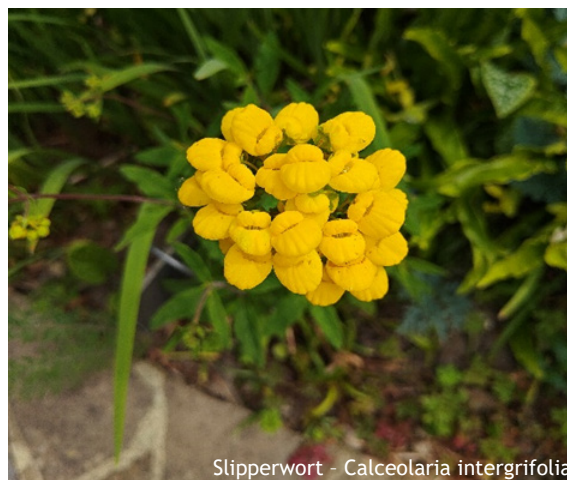
Slipperwort - Calceolaria intergrifolia