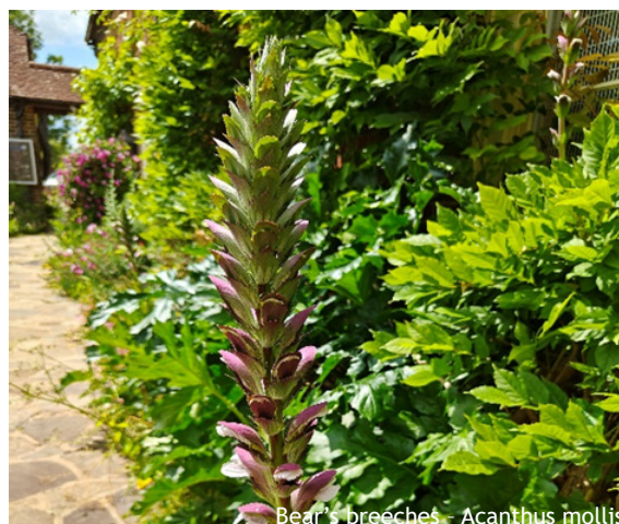
Bear's breeches - Acanthus mollis