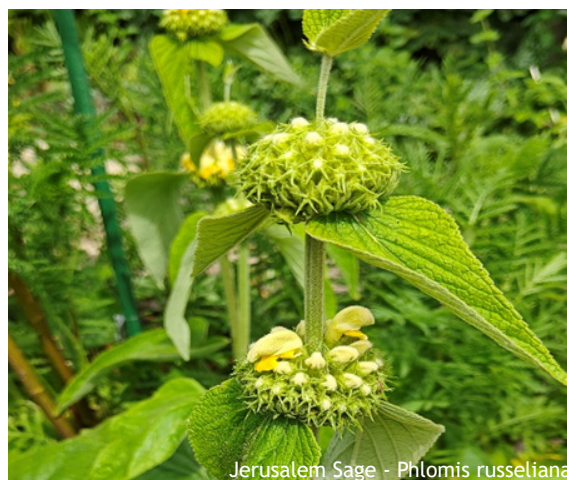
Jerusalem Sage - Phlomis russeliana