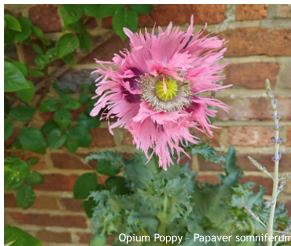
Opium Poppy - Papaver somniferum